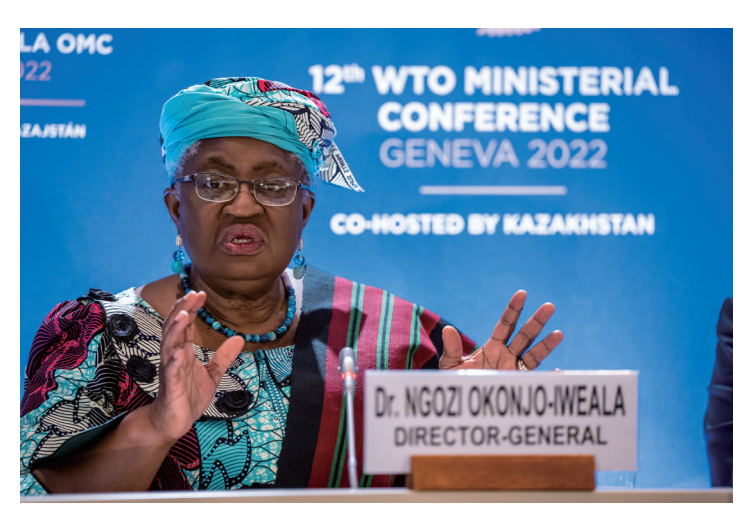
Nigeria's Ngozi Okonjo-Iweala, director general of the World Trade Organization (WTO) speaks at a press conference after the closing of the 12th Ministerial Conference (MC12) at the headquarters of WTO in Geneva, Switzerland, Friday, June 17, 2022.

Multilateral frameworks in the economic realm such as the G20 and APEC have faced difficulties, with a series of ministerial meetings unable to adopt joint statements due to the conflict between Western countries plus Japan and Russia over the invasion of Ukraine. Despite this situation, an agreement on a summit declaration was reached at the G20 Summit in November, followed by the adoption of a summit declaration at the APEC Summit held in the same month. These declarations stated that