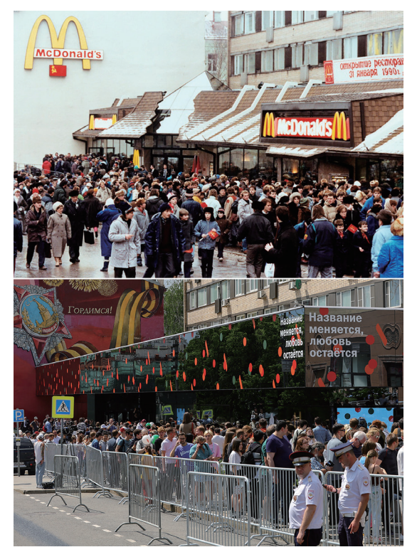
A combination picture shows people queueing outside Moscow's first McDonald's restaurant during its opening in Moscow, Russia January 31, 1990 (top), and people gathering near the new restaurant "Vkusno & tochka", which opened following McDonald's Corp company's exit from the Russian market, in Moscow, Russia June 12, 2022.

resource revenues. Subsequently, when Russia launched its invasion of Ukraine, the G7 and other governments implemented a series of economic sanctions in close coordination against Russia and Belarus. These sanctions included exclusion from the SWIFT international payments network, freezing of assets of oligarchs and other entities, de facto export bans on commodities and luxuries, revocation of MFN status, and restrictions on imports of energy, diamonds, and other goods. The G7 also agreed to introduce a framework to cap the import price of Russian oil to prevent Russia from financing its war effort, while the EU also reached a political agreement at a special European Council meeting in May to ban imports of Russian crude oil and petroleum products, except for imports via pipeline, by year-end. Based on coordination through the G7, Japan also carried out a series of measures, including freezing assets, strengthening export controls, revoking MFN status, and introducing import control measures.