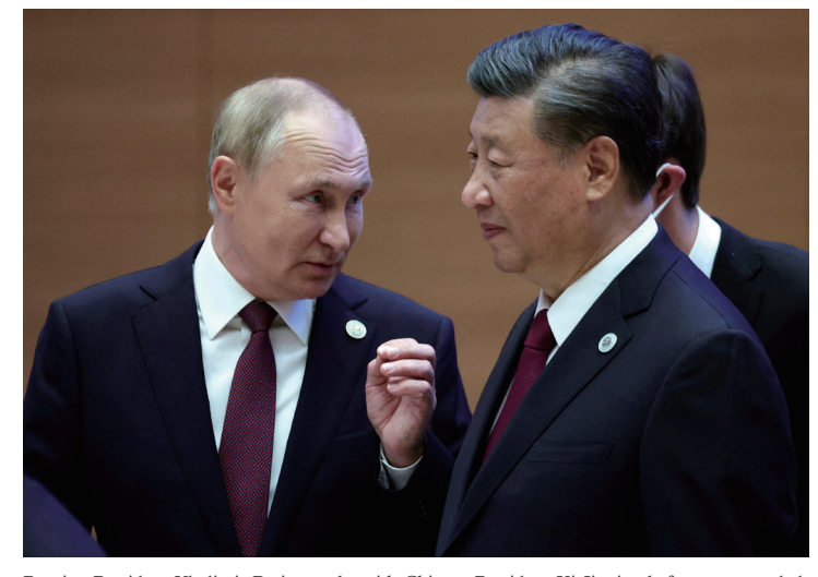
Russian President Vladimir Putin speaks with Chinese President Xi Jinping before an extendedformat meeting of heads of the Shanghai Cooperation Organization summit (SCO) member states in Samarkand, Uzbekistan September 16, 2022. ATTENTION EDITORS - THIS IMAGE WAS PROVIDED BY A THIRD PARTY. TPX IMAGES OF THE DAY (Uzbekistan)

On the other hand, China also has reasons to strengthen its relationship with Russia. First, it is to counter the United States from a strategic standpoint. Although Russia's economic position is