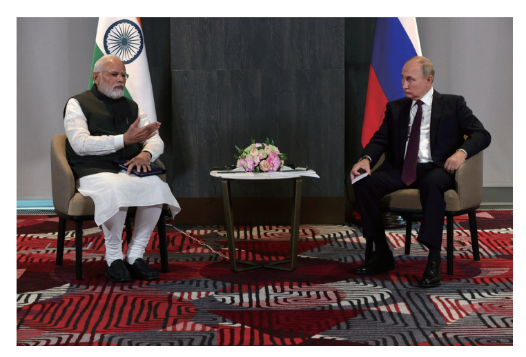
Russian President Vladimir Putin and Indian Prime Minister Narendra Modi attend a meeting on the sidelines of the Shanghai Cooperation Organization (SCO) summit in Samarkand, Uzbekistan September 16, 2022. ATTENTION EDITORS - THIS IMAGE WAS PROVIDED BY A THIRD PARTY. (Uzbekistan)

In response to Russia's aggression against Ukraine, India has noted the importance of the rule of law and the principle of territorial integrity, and Prime Minister Modi has directly told President Putin that this is "no time for war". However, India has abstained from all draft resolutions condemning Russia at the UN Security Council and General Assembly, urging settlement of the issue through dialogue and diplomacy. India has also maintained its pursuit of national interests on the economic front