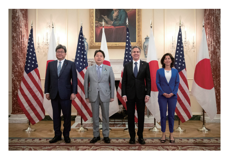
U.S. Secretary of State Antony Blinken and Commerce Secretary Gina Raimondo participate in a family photo with Japan's Foreign Minister Yoshimasa Hayashi and Koichi Hagiuda, Japan's Minister of Economy, Trade, and Industry, during the U.S.-Japan Economic Policy Consultative Committee (EPCC) at the State Department in Washington, U.S., July 29, 2022. REUTERS/Tom Brenner/Pool (United States)

Generally said, the Biden administration is more focused on working with allies and partners than the previous Trump administration. As the Biden administration entered its second year, the substance of international collaboration in areas related to economic security such as supply chain resilience, data governance, export controls, and investment screenings gradually became clear.