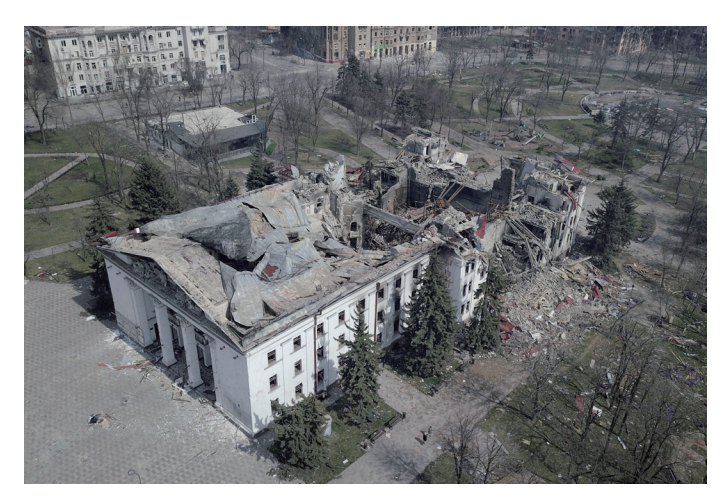
A view shows the building of a theatre destroyed in the course of Ukraine-Russia conflict in the southern port city of Mariupol, Ukraine April 10, 2022. Picture taken with a drone.

As military clashes between the Ukrainian government and pro-Russian factions in the Donbass region of eastern Ukraine calling themselves the "Donetsk People's Republic" and the "Lugansk People's Republic" escalated from 2021, Russia insisted that NATO membership for Ukraine would never be accepted and deployed 100,000 troops around the border to apply pressure. On January 10, 2022, the US and Russia held a "strategic stability dialogue" and, on January 21, a meeting between the US and