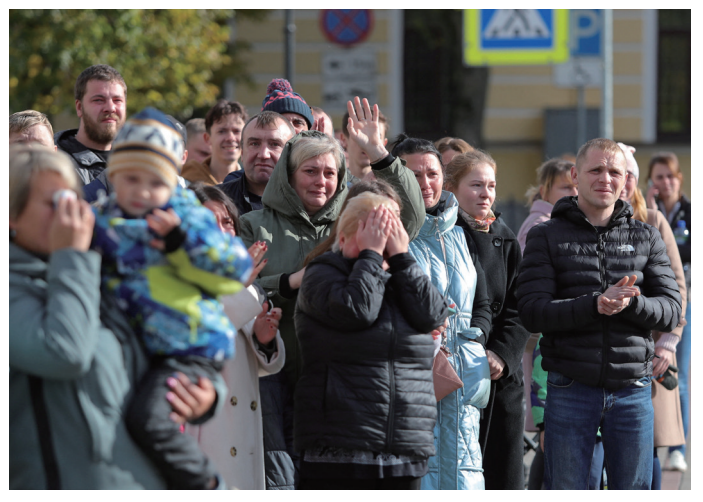
Relatives and acquaintances of Russian reservists react at a gathering point in the course of partial mobilisation of troops, aimed to support the country's military campaign in Ukraine, in the town of Gatchina in Leningrad Region, Russia October 1, 2022. (Russia)

Some observers in Russia believe that the more pressure from the West, the more the Russian public will rally around the president and support his actions. It has also been pointed out that Russia has been subject to Western sanctions since the annexation of Crimea in 2014, and the population becoming "accustomed to sanctions" is one reason why political dissatisfaction with the Putin administration has not grown. On the other hand, some analysts believe that if the war in Ukraine and the confrontation with the West intensify in