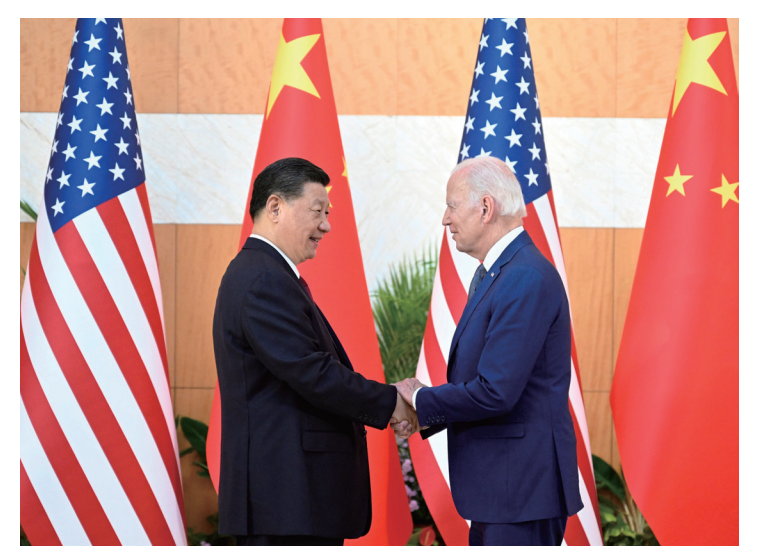
Chinese President Xi Jinping meets with U.S. President Joe Biden in Bali, Indonesia, Nov. 2022.

The basic structure of the US-China confrontation remained unchanged after Russia's invasion of Ukraine. In the first half of 2022, there were several meetings between US and Chinese leaders and foreign ministers, building momentum for dialogue but, after the summer, a confrontational tone was evident, especially over Taiwan. Although the November summit saw efforts to manage relations and cooperate on global issues such as climate change and energy supply, the two countries' claims